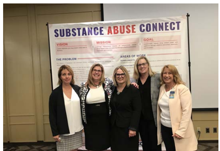
Members of the Substance Abuse Connect Team